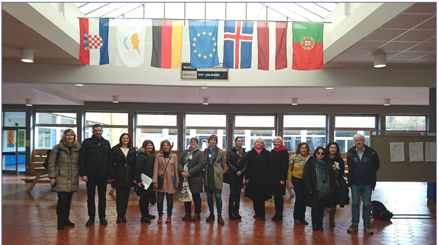
All participants in the school hall

In the afternoon of the second day, there was a Civil Reception at the town hall where all the participants met the Mayor of Lüdenscheid Dieter Dzewas who gave a nice speech welcoming all the partners. After that, all the participating teachers visited the Phänomenta (interactive science museum) in Lüdenscheid which was quite interesting.