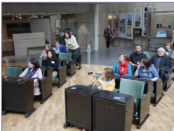
House of History, Bonn

Also, presentations were held about the ethnic composition of each country through history to the present. Special emphasis was given to the ethnic composition of each school and the comparison of achievements of native students and immigrant students.