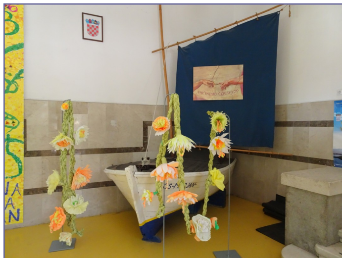
Beautiful art decorations in the school