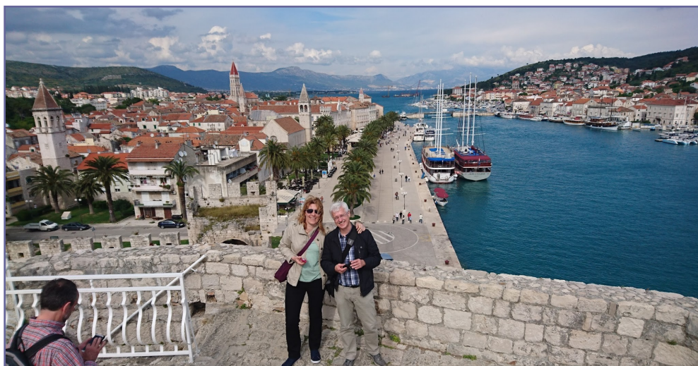
On the top of Kamerlengo castle, in Trogir