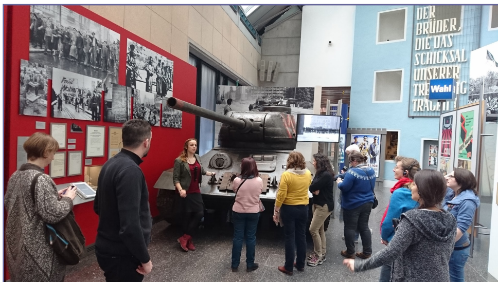
House of History, Bonn