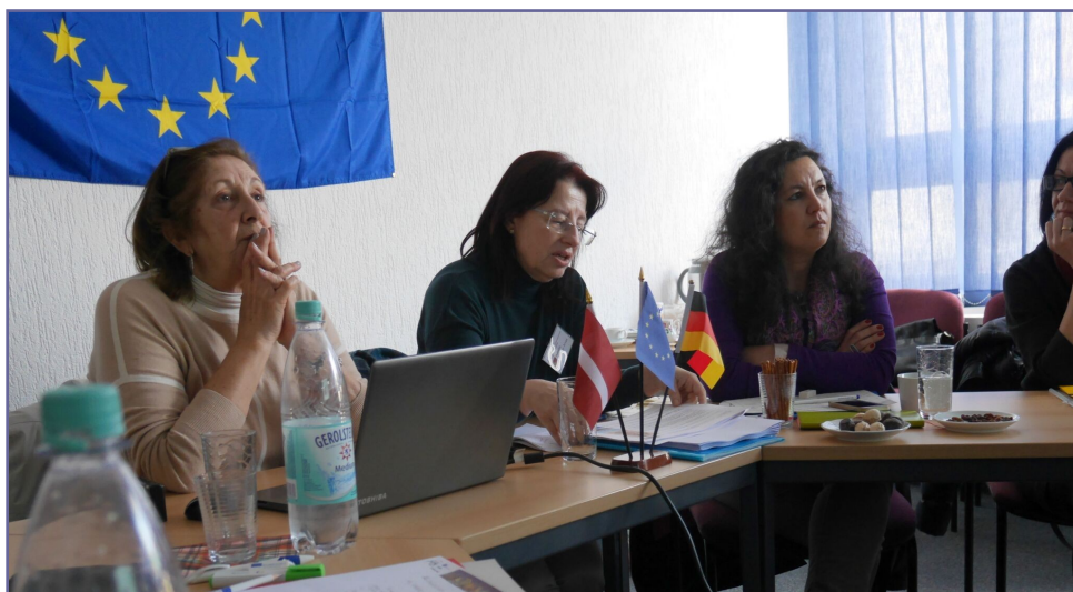
In the seminar room