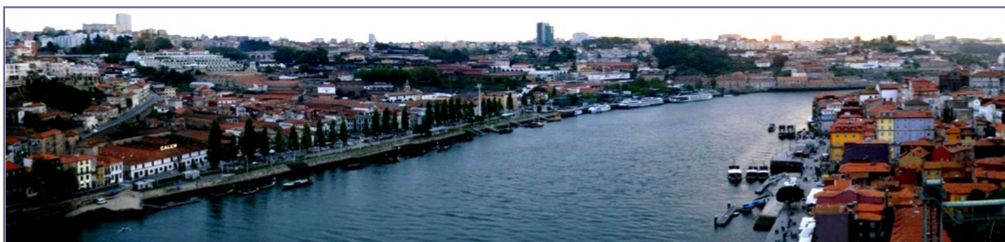
Panorama of Vila Nova de Gaia (left), the river Duoro and Porto (right)

The meeting ended in the evening with the official friendship dinner at the spectacular restaurant of the port wine cellar of Porto Cruz.