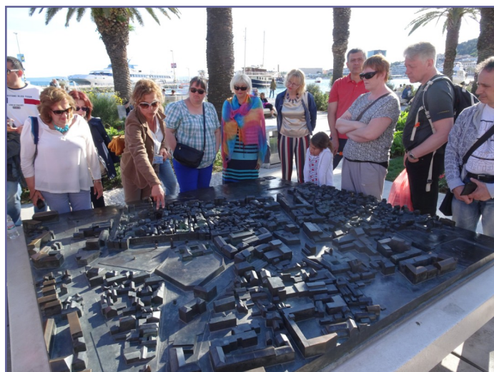
City guided tour