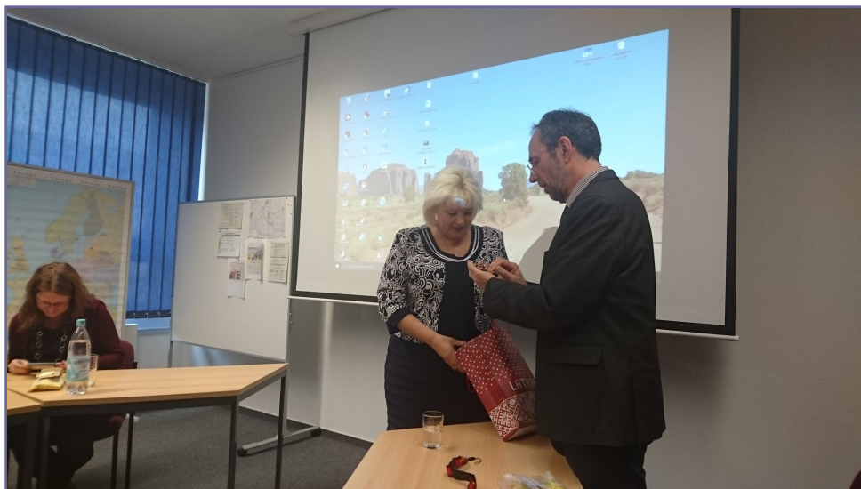
A welcome present for the headmaster