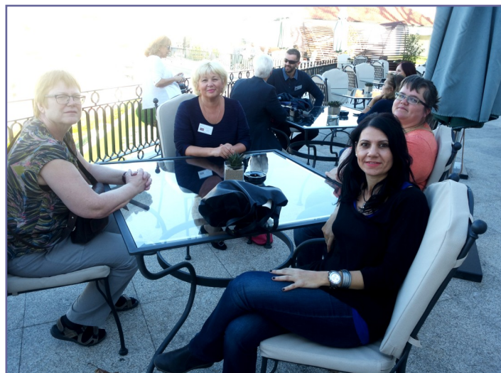
Afternoon coffee in a beautiful hotel location overlooking Vila Nova de Gaia and Porto.

The next day (23 rd October) we saw the last presentations and started to discuss the further course of the project. The project coordinator Ludmilla Renge suggested a twofold project plan: