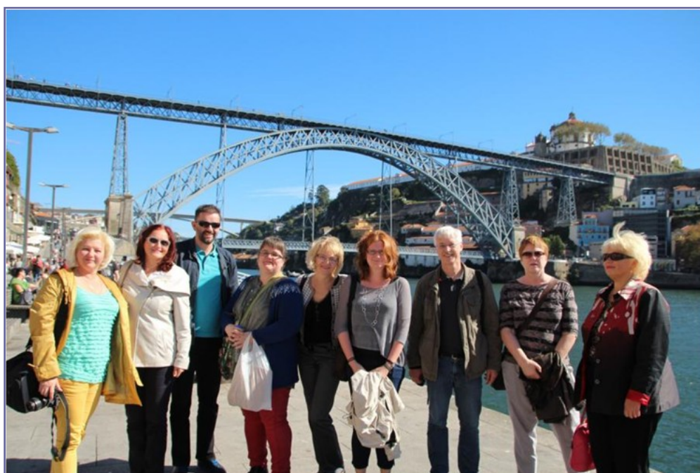
In front of the famous bridge in Porto

The afternoon was filled with the remaining presentations of school systems and participating schools.