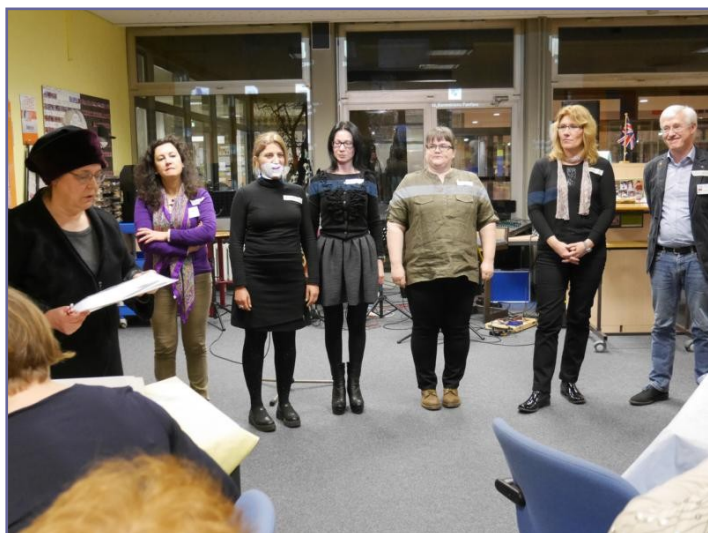
Erasmus+ Party, Cabaret