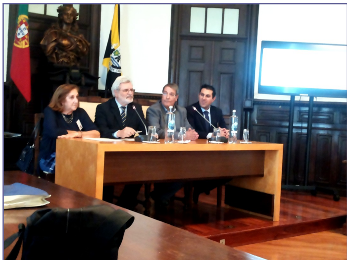
Visiting Mayor in the impressive townhall