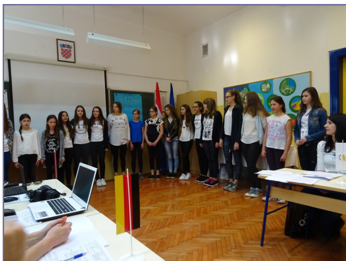
Daily musical goodmorning